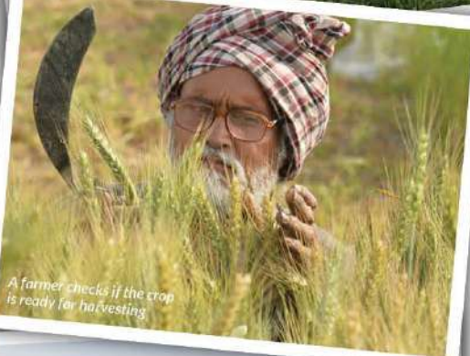
A farmer checks if the crop is ready for harvesting