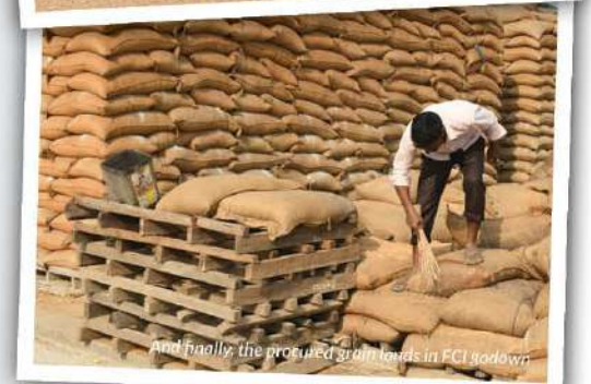
And finally, the procured grain lands in FCI godown