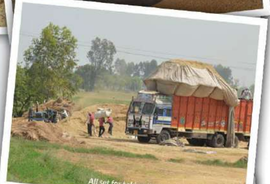
All set for taking the grain to the anaj mandi