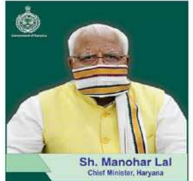
Sh. Manohar Lal Chief Minister, Haryana

One State level Rehabilitation Centre will be established at Panchkula, while four divisional level centres are proposed at Rohtak, Gurugram, Kamal and Hisar. These centres will be equipped with the latest world class sports-medicine apparatus and will be manned by well qualified staff, psychologists and physiotherapists. In order to ensure that there is no crunch of funds, Rs 394 crore has been allocated for sports for the current fiscal.