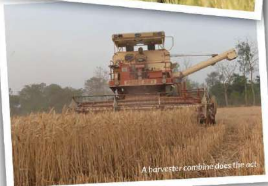
A harvester combine does the act