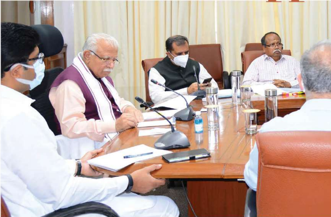
The Chief Minister, Mr Manohar Lal, presiding over a review meeting through a video conference regarding COVID-19 situation in the state with Administrative Secretaries and Deputy Commissioners, in Chandigarh. The Deputy Chief Minister, Mr Dushyant Chautala, is also seen in the picture