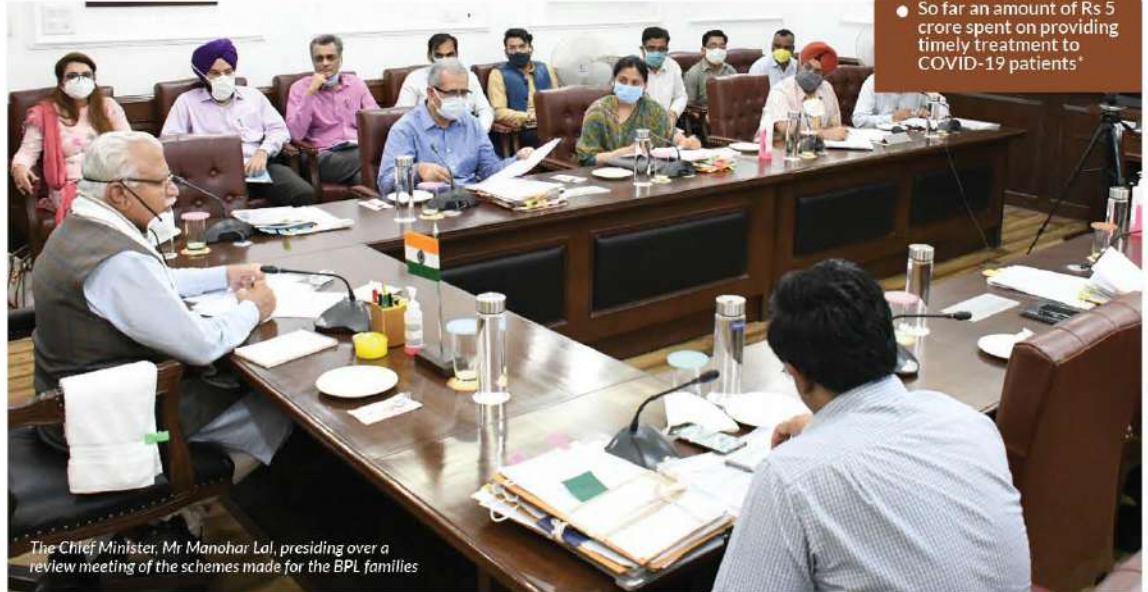
The Chief Minister, Mr Manohar Lal, presiding over a review meeting of the schemes made for the BPL families