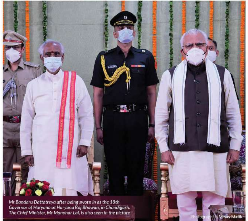
Mr Bandaru Dattatreya after being sworn in as the 18th Governor of Haryana at Haryana Raj Bhawan, in Chandigarh. The Chief Minister, Mr Manohar Lal, is also seen in the picture