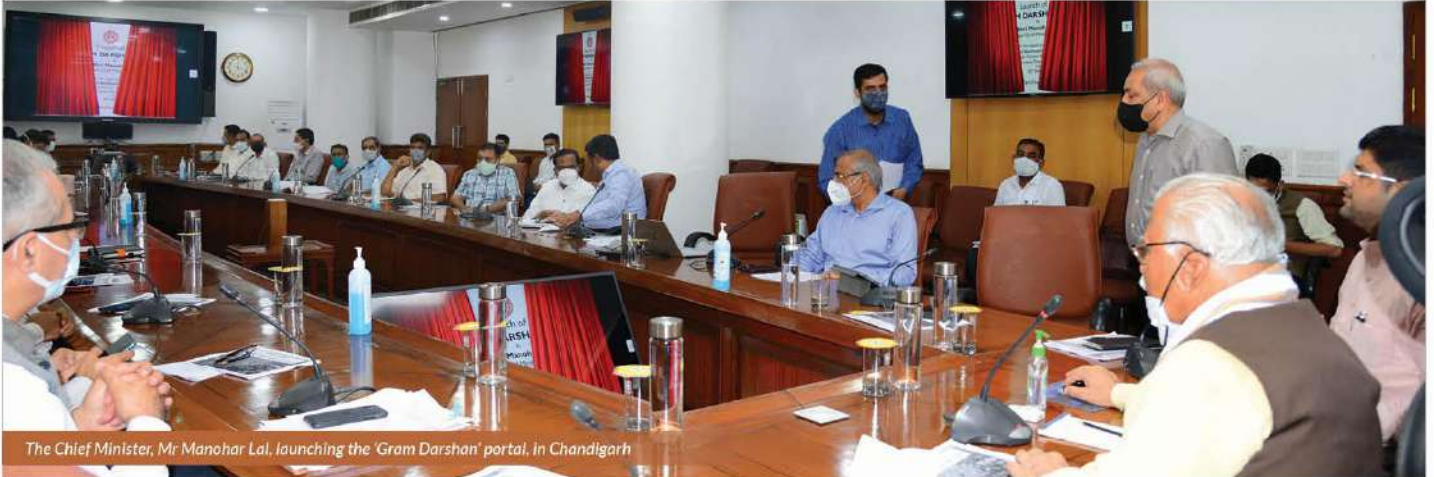
The Chief Minister, Mr Manohar Lal, launching the 'Gram Darshan' portal, in Chandigarh