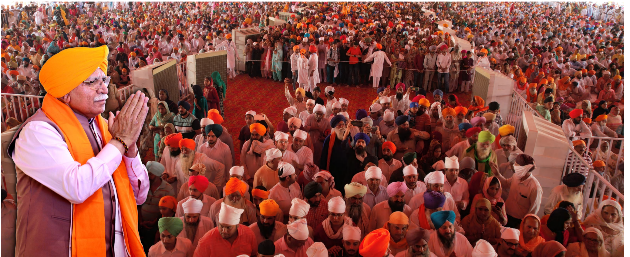
The Chief Minister, Mr Manohar Lal, greets the massive gathering at the state-level function held in Panipat to mark the 400th Prakash Purab of Guru Tegh Bahadur ji. (More photographs on PP 4-5)