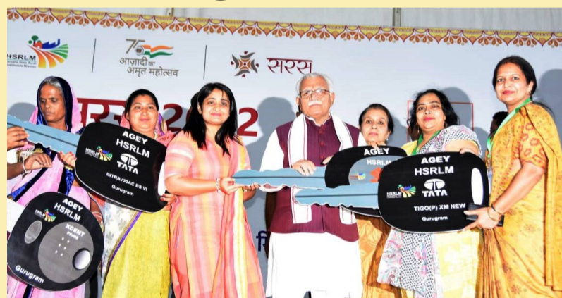
Chief Minister Mr. Manohar Lal honouring self-help women entrepreneurs at the Saras fair in Gurugram.

Chief Minister Mr Manohar Lal during his visit to the Saras Mela said that apart from providing a platform for livelihood to the women of Self Help Groups, Saras Mela also gives us the vision of 'Mini India'. During this, the Chief Minister worshiped 'Unnati Self Help Group' of women of three self-