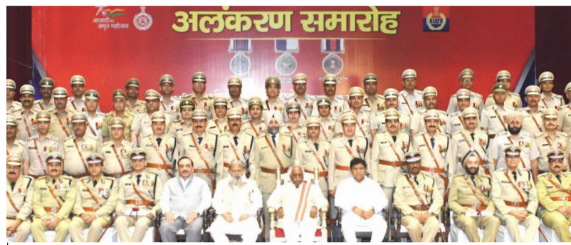
Haryana Governor Bandaru Dattatraya at the police investiture ceremony in Panchkula along with Vidhan Sabha Speaker Gian Chand Gupta (R) and Home Minister Anil Vij (L).