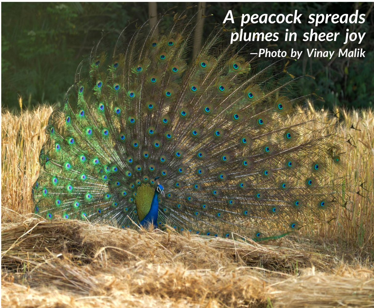
A peacock spreads plumes in sheer joy