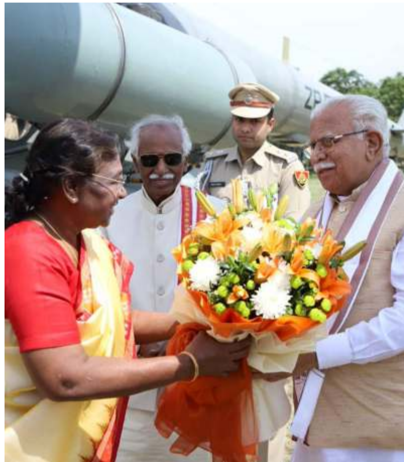
The President, Mrs Droupadi Murmu, being welcomed with a bouquet by the Chief Minister, Mr Manohar Lal, on her arrival in Chandigarh. The Governor, Mr Bandar Dattatreya, is also seen in the picture. See also P-7