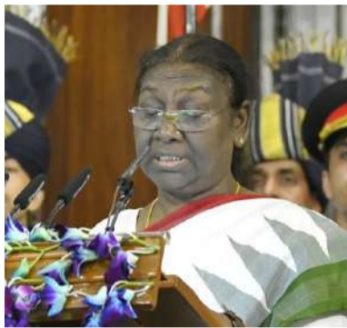
Droupadi Murmu being sworn in as first tribal President of the country in Rashtrapati Bhavan. She is 15th incumbent to the office.