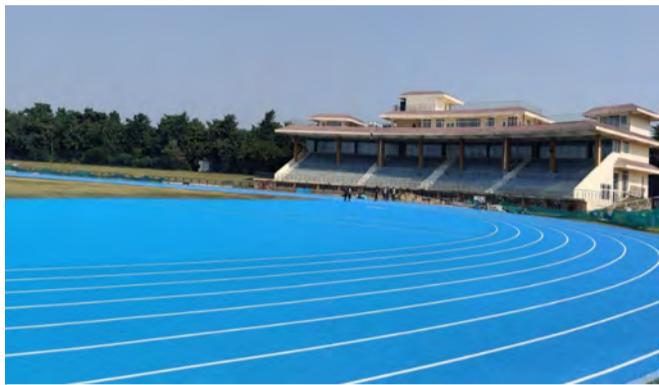
The synthetic track built at Tau Devi Lal Sports Complex in Panchkula