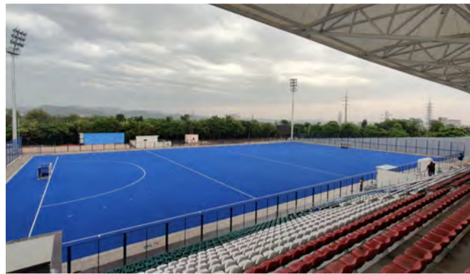
A view of the renovated Hockey Stadium in Shahabad.