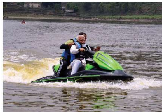
The Chief Minister, Mr Manohar Lal, riding a jet scooter, in Tikktal

Olympics squad to have 30 players from state — Page 8