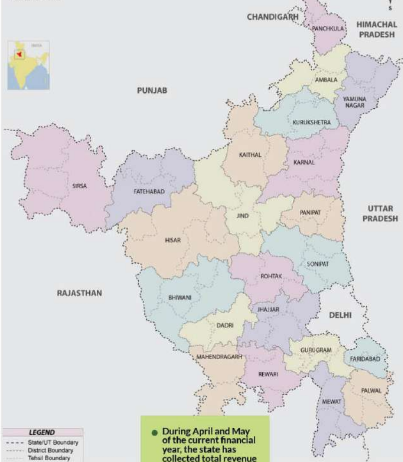
HARYANA TEHSIL MAP

● During April and May of the current financial year, the state has collected total revenue of Rs 861.09 crore from deed registration. ● A total stamp duty of Rs 803.12 crore and registration fee of Rs 57.97 crore were collected.