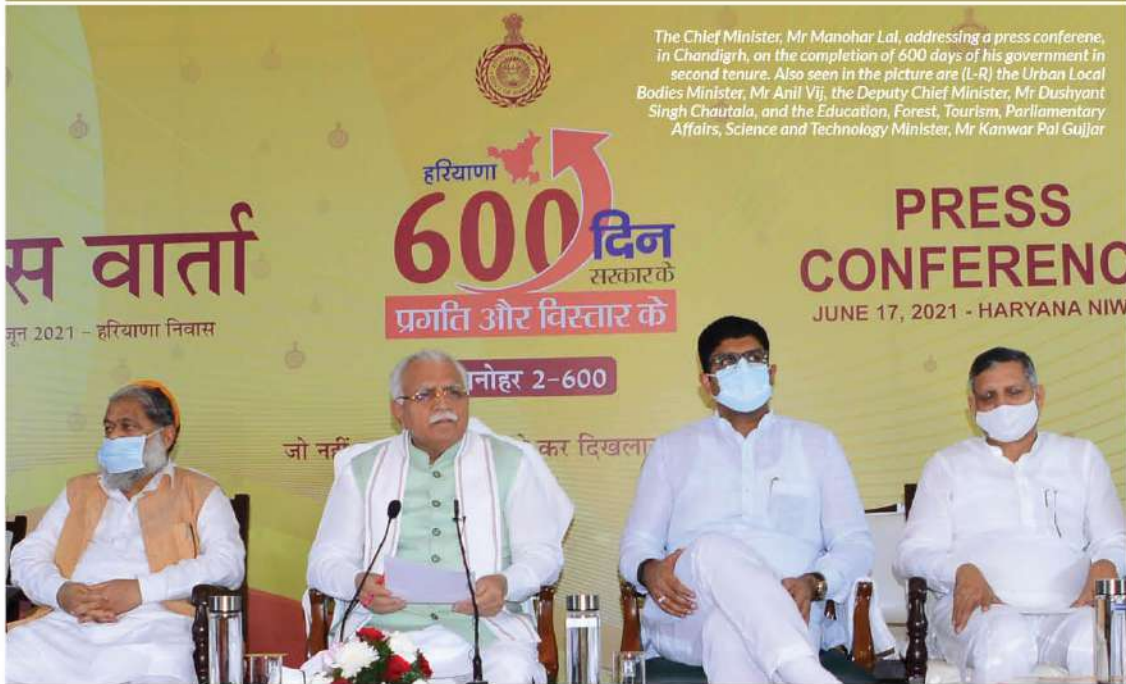
The Chief Minister, Mr Manohar Lal, addressing a press conference, in Chandigarh, on the completion of 600 days of his government in second tenure. Also seen in the picture are (L-R) the Urban Local Bodies Minister, Mr Anil Vij, the Deputy Chief Minister, Mr Dushyant Singh Chautala, and the Education, Forest, Tourism, Parliamentary Affairs, Science and Technology Minister, Mr Kanwar Pal Gujjar