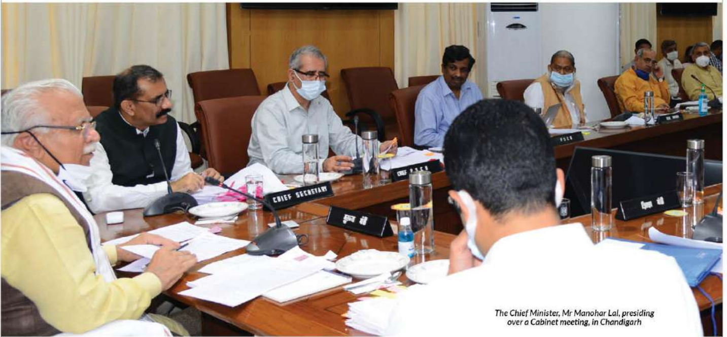
The Chief Minister, Mr Manohar Lal, presiding over a Cabinet meeting, in Chandigarh

Colonizers have been granted relief of interest on the pending dues and for time bound compliances. The colonizers/developers shall pass on the corresponding benefits to their allottees to ensure that the hardships faced by the end-users also get mitigated to that extent.