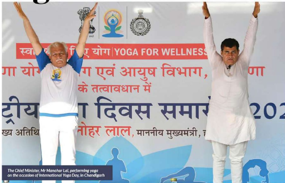
The Chief Minister, Mr Manohar Lal, performing yoga on the occasion of International Yoga Day, in Chandigarh